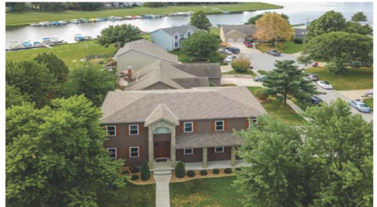
4001 Reef Point -Raintree $370,000 SOLD IN 38 DAYS