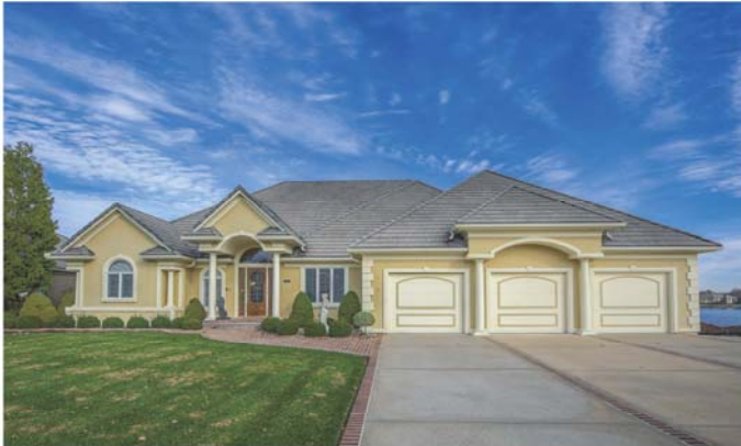
4621 Gull Point Dr -Raintree $999,990 NEW LISTING!