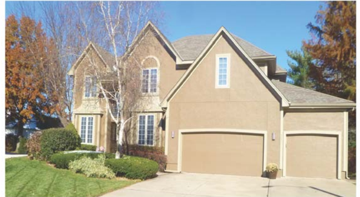
5031 Widgeon Way -Raintree - $459,900 NEW LISTING!