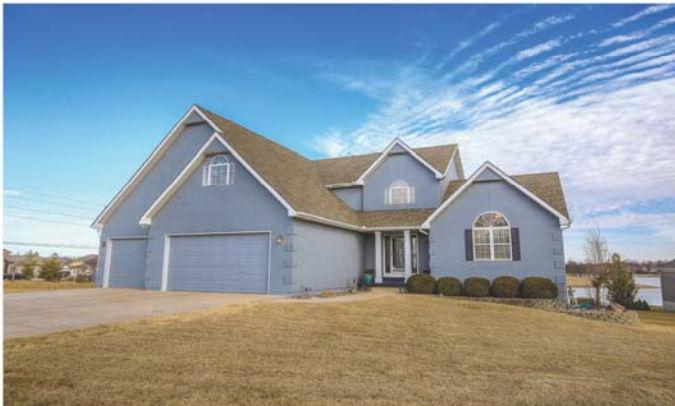
920 Drake Drive - Raintree $376,900 SOLD IN 8 DAYS !!