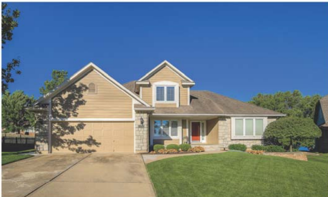
5038 Mallard Point- $435,000 -Raintree SOLD in 27 Days!!!