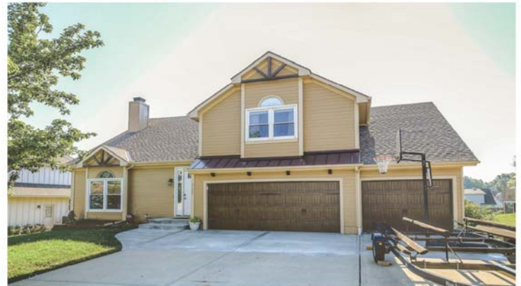
5125 Royal Tern Pt - Raintree $328,000 SOLD IN 43 DAYS!!