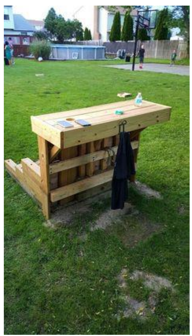
Horseshoe back